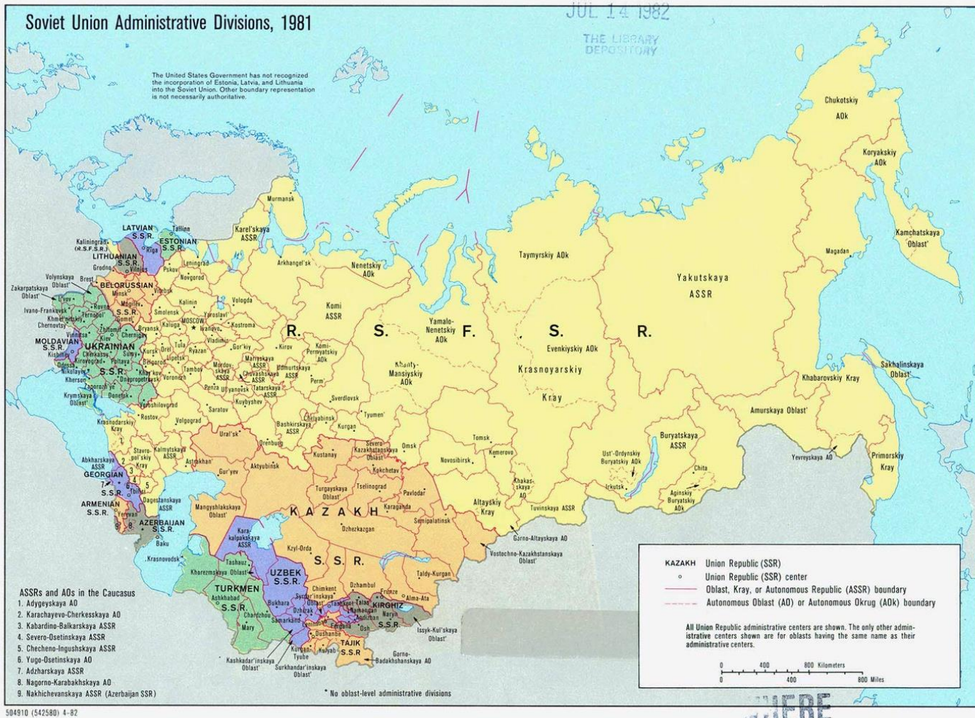
Figure 1 -Map of the USSR – 1981